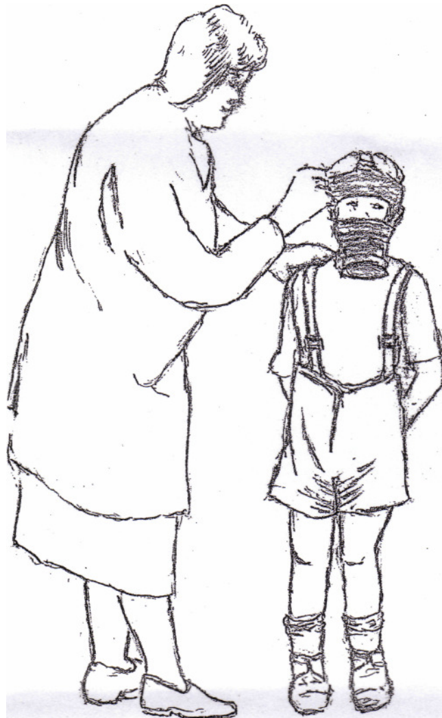
LEARNING THE USE OF A GAS MASK .1939