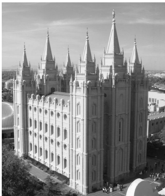
The Mormon Temple at Salt Lake City