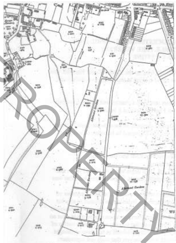
Horsewell & Steven's Close allotments to west of Horsewell Lane