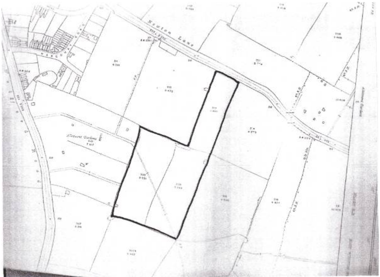
1914 map with the three closes outlined