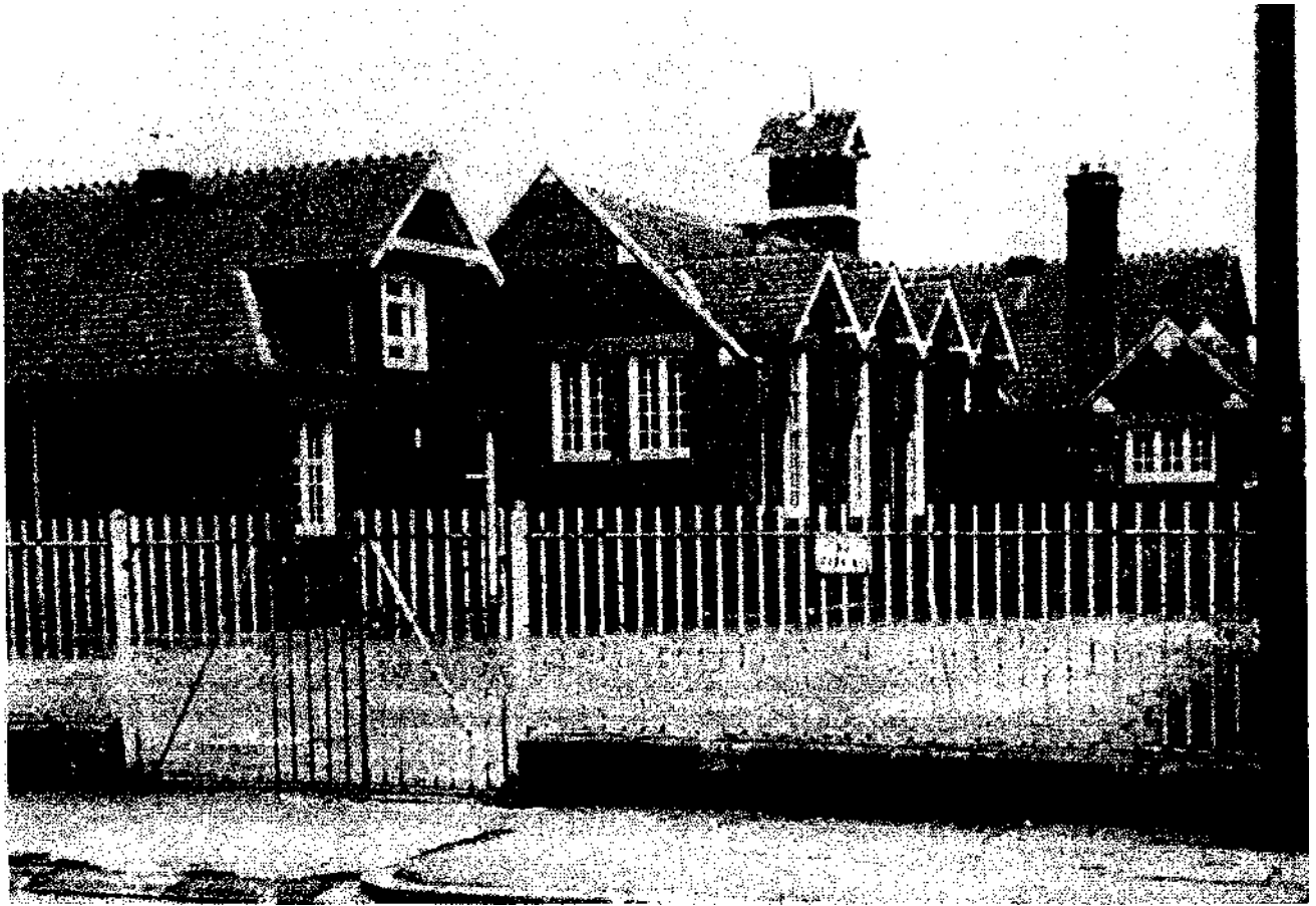
Both show rear views of the 1886 school. Below on the right are the bicycle sheds & the back of the Picture House in Blaby Road. All photos by Peter Mastin taken in late 1970s.