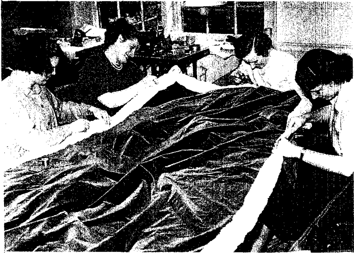
Dressmakers working on what looks like an ermine trimmed train