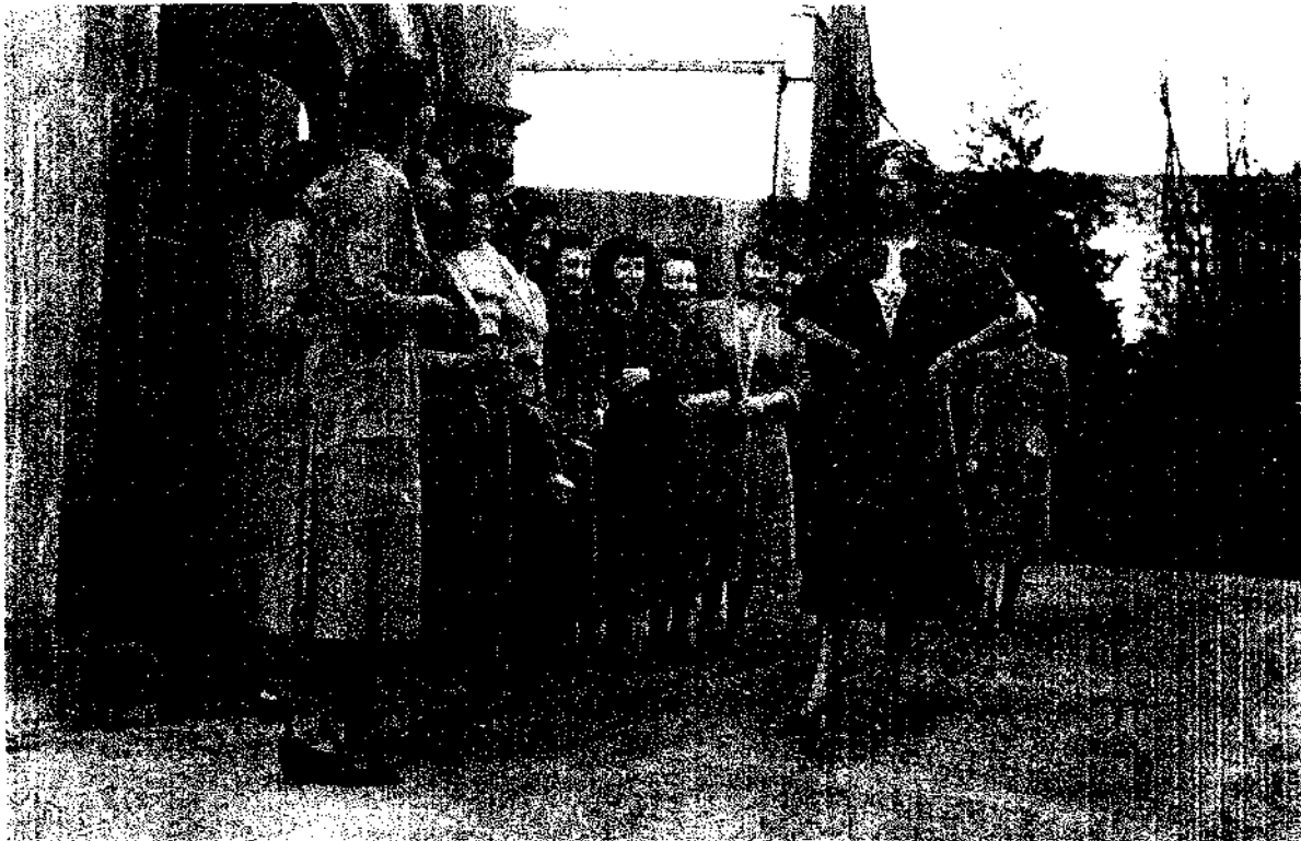
Girls from the workroom gather outside the Hall in 1949 to watch a mannequin parade