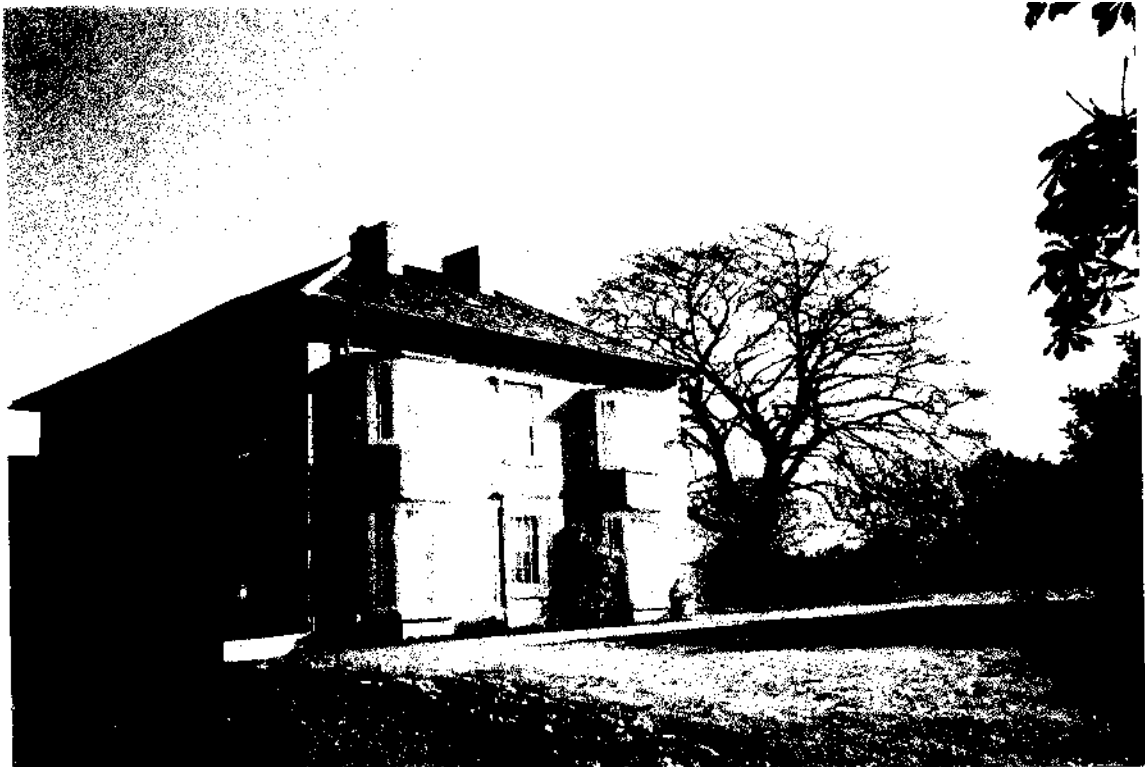
The Grange in 1990s

Sources: Sale Catalogue - LRO 3D42/M33/3, Grangeway Road deeds in private hands, Belgian Refugees ?? Cannot recall the source at time of writing!