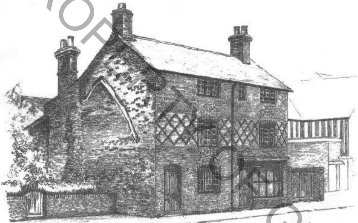
Wigston Framework Knitting Museum